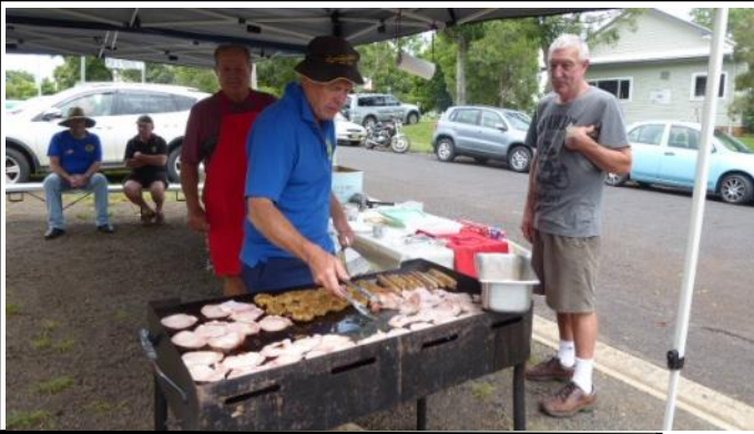
LEFT: A good BBQ chef needs a lot of supervision—Uhhh, that IS what they are doing standing and sitting watching, isn't it??